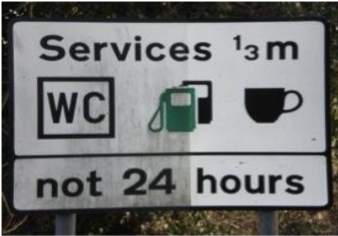
Superficie tratada fotocatalíticamente, tras tres años a la intemperie